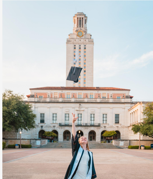
UT Austin '20 Psychology B.S.