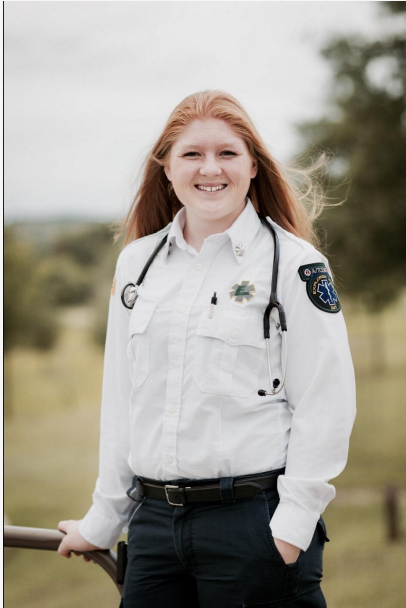
Westlake High School '16