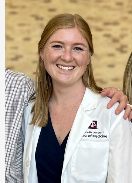
Texas A&M '26 School of Medicine School of Law